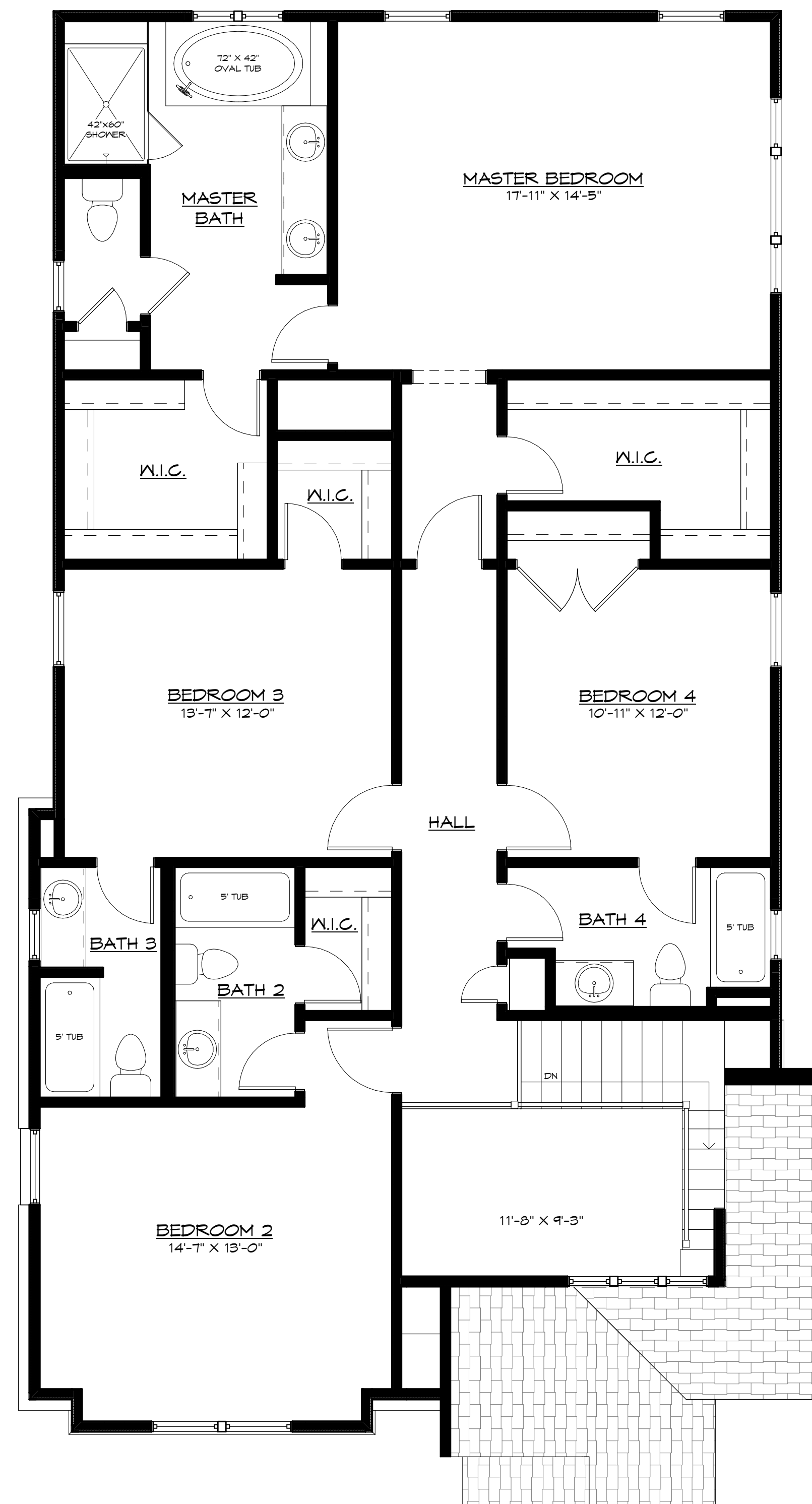
2 SECOND FLOOR PLAN 1/4" = 1'-0"