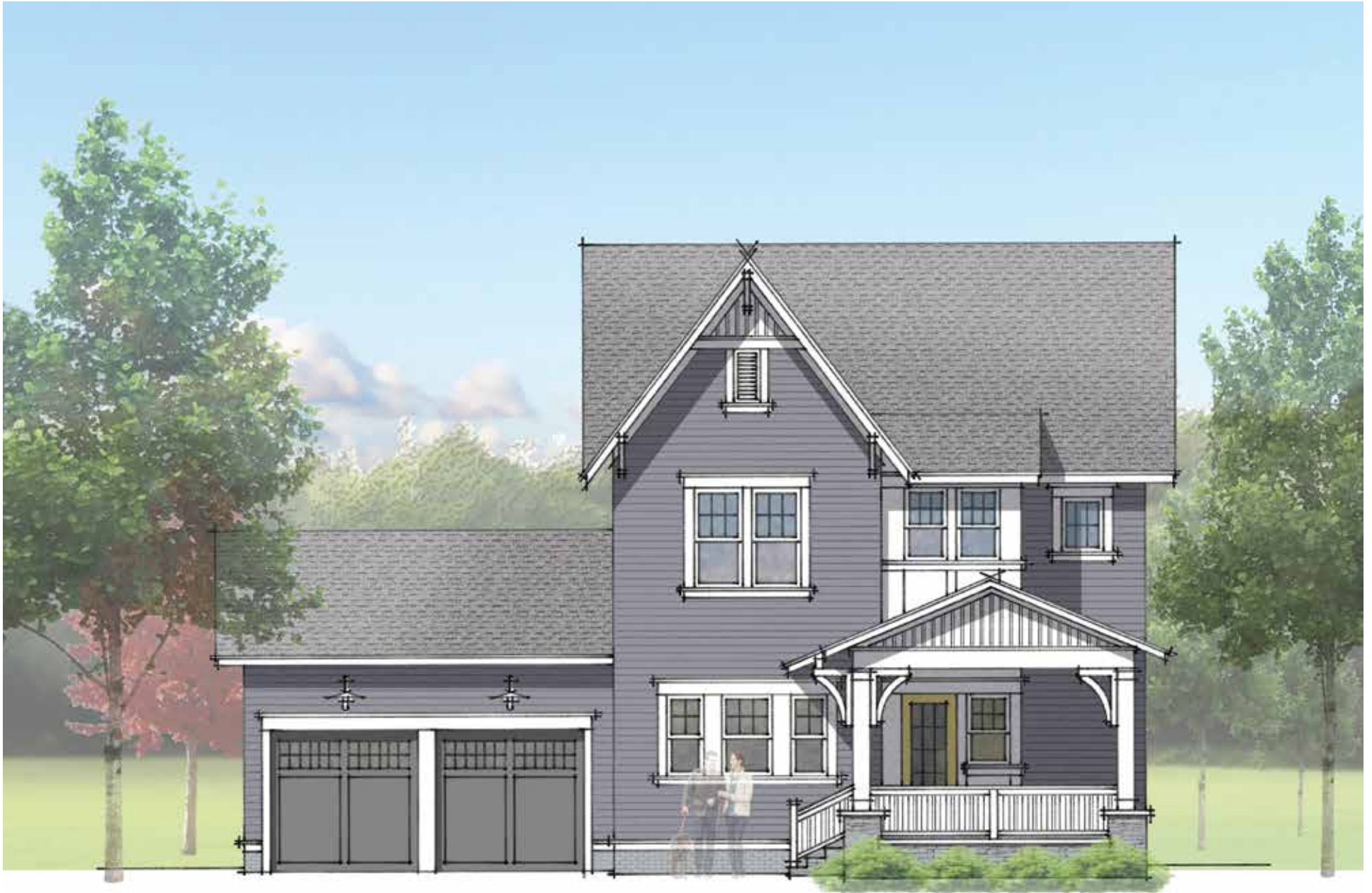
Davidson Hall - Lot 27