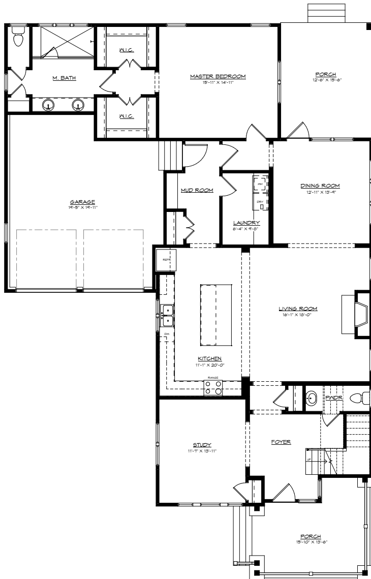
1 FIRST FLOOR PLAN 1/4" = 1'-0"